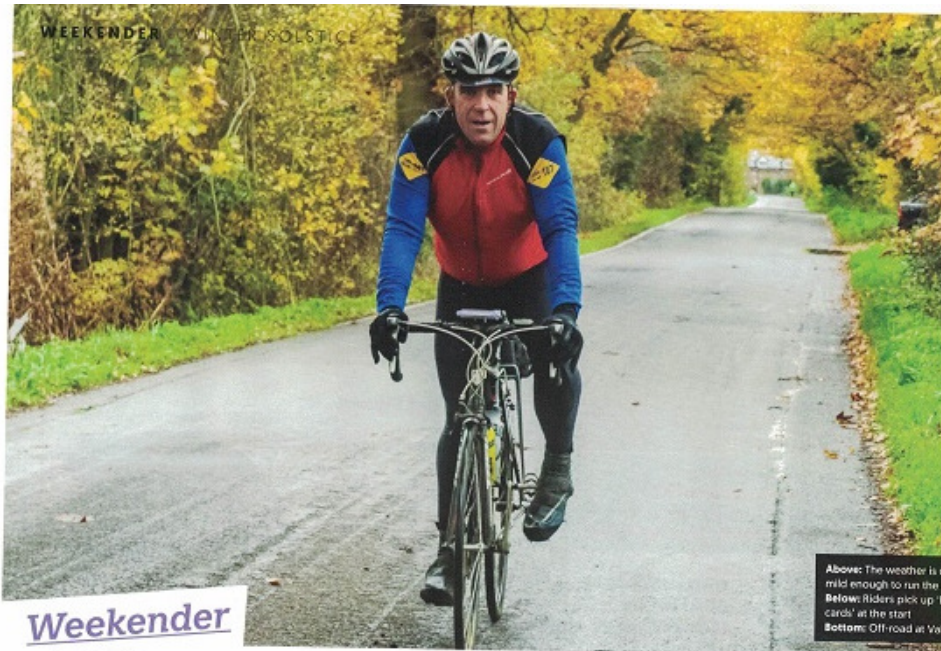
Above: The weather is mild enough to run the ride. Below: Riders pick up 'b' cards' at the start. Bottom: Off-road at Vale Royal.